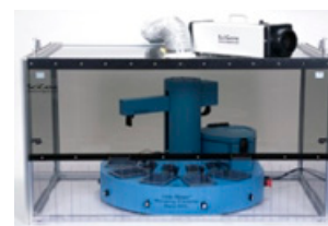
NoZone® WS Workspace with Little Dipper Processor inside