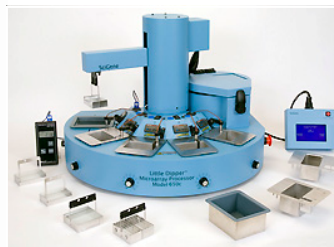
Little Dipper Processor with accessories.

Automates post-hybridization processing of self spotted microarrays on glass slides. Controls wash time, agitation, buffer temperatures and drying using an integrated centrifuge. Batches of 1 to 24 slides are processed following operator-specified programs with the handheld touch screen. Ready for use with Agilent, OGT, BlueGnome or Illumina microarrays or for pre-and post hybridization processing of FISH slides with additional accessories.