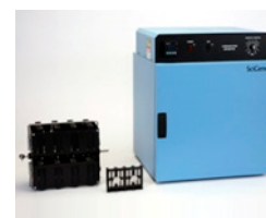
Mai Tai® Hybridization System