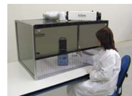
NoZone® WS Workspace