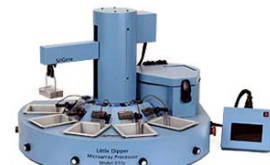
Little Dipper® Processor