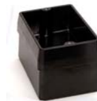
Use to heat buffers for washing arrays