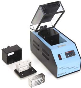
Hybex heating base with microarray chambers and slide racks.

Complete system for incubating and washing microarrays. Comprised of a heating base with two humidified chambers that hold removable racks for incubating up to 16 slides. After incubation, racks are removed from the chambers for manual slide washing or transferred to the Little Dipper Processor for automated washing and drying. A waterbath insert is also available for heating wash buffers or other applications.