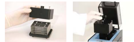
Secure top cover