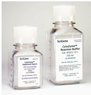
CytoZyme Stabilized Pepsin and Reaction buffer.

CytoZyme Stabilized Pepsin is a liquid formulation of purified pepsin with enhanced shelf life. CytoZyme is used for readying tissue samples for hybridization with nucleic acid probes used in cytogenetic assays including FISH. Provided as a 50X concentrate ready for dilution and activation in CytoZyme Reaction Buffer.