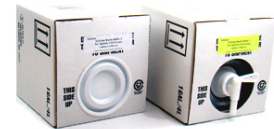
FISH Wash Buffers 1 and 2