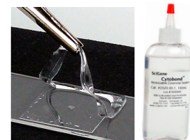
CytoBond Removable Coverslip Sealant